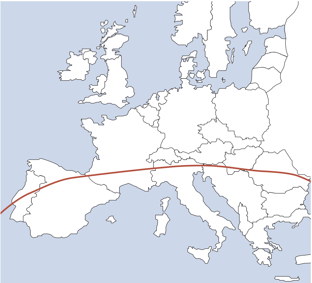
Figure 2a: Rhipicephalus sanguineus is primarily a tick of southern Europe: below the red line indicates where it occurs most frequently

Ticks are temporary blood feeding parasites which spend a variable time on their hosts; in the case of ixodid ticks, each stage feeds for only a short period of one to two weeks. Generally, ticks are of most importance as vectors of bacteria, viruses, protozoa and nematodes affecting both companion animals and humans. Infections can be transmitted in saliva as the ticks feed or, more rarely, after the tick is ingested in the case of Hepatozoon spp..